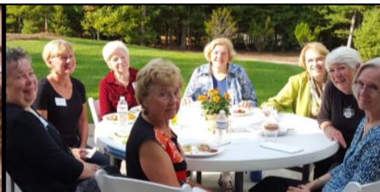
Potluck at The Ramble