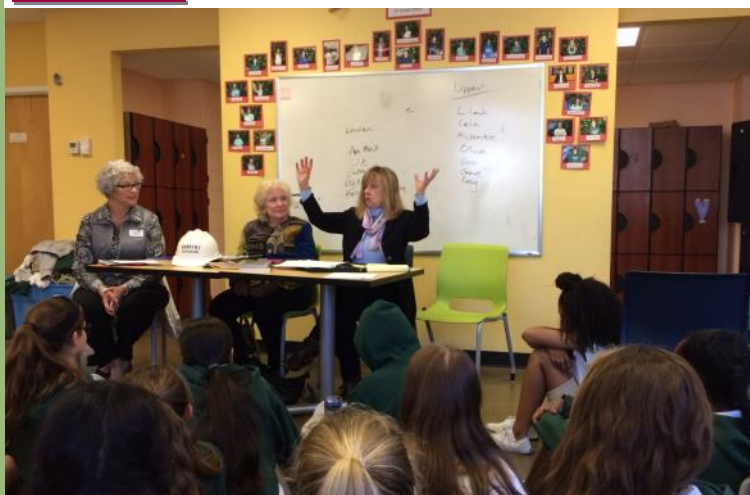
AAUW Members shared experiences March 2 with Hangar Hall students on Women in the 21st Century Day