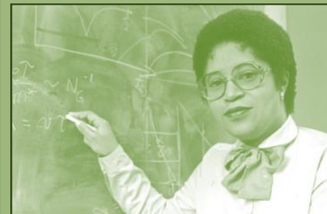
Dr. Shirley A. Jackson

was the first African American woman to receive a Ph.D. in 1973 from the Massachusetts Institute of Technology (MIT) in physics. Dr. Jackson conducted breakthrough basic scientific research that enabled others to invent the portable fax, touch tone telephone, solar cells, fiber optic cables, and the technology behind caller ID and call waiting. Dr. Jackson now serves as the eighteenth president of