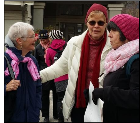
Getting ready to march, 2018