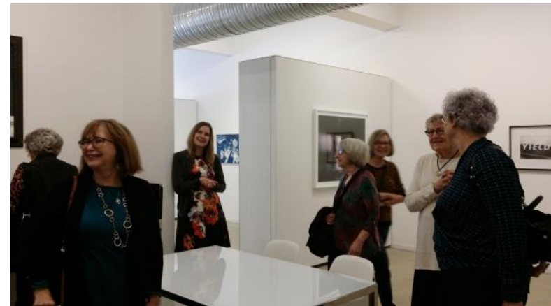
AAUW-Asheville Photo Group visited the Tracey Morgan Gallery 2/21