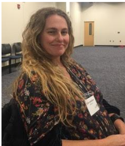
More Images from the Equi-Tea held on February 19th on UNCA Campus